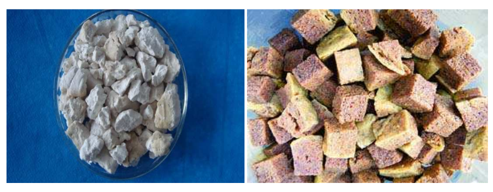
Figure 3: Seera