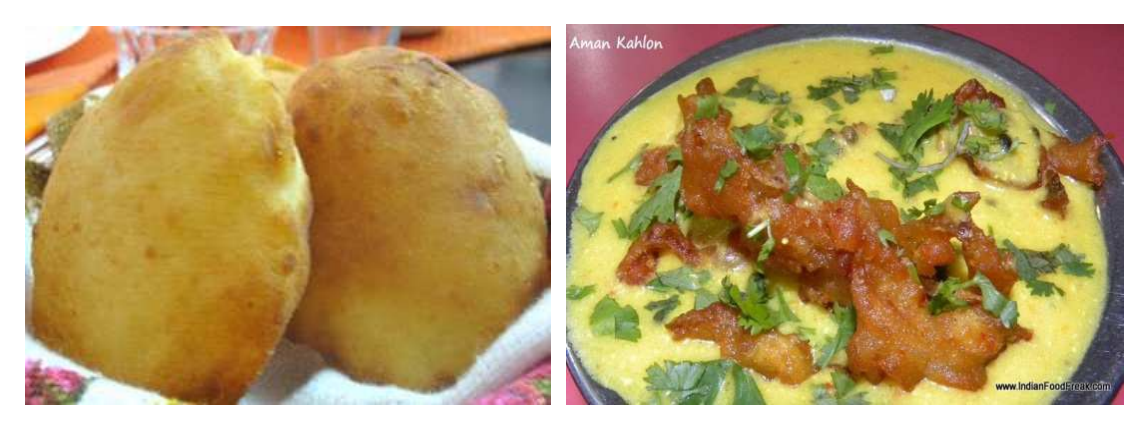
Figure 1: Bhaturu