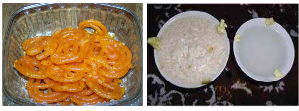
Figure 7: Jalebi